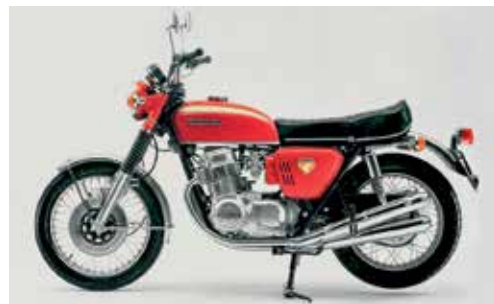
The Dream CB750 FOUR, which hit the market in July 1969

After 5 consecutive titles in the World Grand Prix Road Racing Series, Honda decided to withdraw and turn toward its primary target: transfer the technology obtained in competition to develop high-performance consumer machines. After a first attempt with a 450cc, Honda released the CB750 Four in January 1969. The initial production forecast of 1,500 units a year became soon a monthly figure and then jumped to 3,000 units/month. By pushing the boundaries of performance, reliability and easy handling in motorcycles, Honda created a new class of Superbikes. The CB1000R is the modern expression of the same spirit that guides Honda engineers since decades.