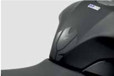
TANK PAD 08P61-KYJ-800

Enhance the sportiness of the CB500F with this easy to apply stripes kit. One kit per wheel is needed. 5 colours available: • Lemon Ice Yellow (shown) 08F72-MKP-J40ZD • Indi Grey Metallic 08F72-MKP-J40ZE • Pearl Metalloid White 08F72-MKP-J40ZG • Mat Crypton Silver 08F72-MKP-J40ZH • Seal Silver Metallic 08F72-MKP-J40ZJ