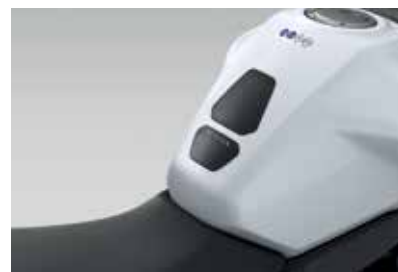
TANK PAD 08P70-MGC-JQ0

The skid pad, featuring the Honda logo, reduces damage of the fairing in case of a fall.