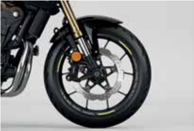
WHEEL STRIPES KIT 08F72-MKP-J40ZD / 08F72-MKP-J40ZE / 08F72-MKP-J40ZG / 08F72-MKP-J40ZH / 08F72-MKP-J40ZJ

Custom shaped, colour-matching rear Seat Cowl that replaces the standard passenger seat for a sportier look.