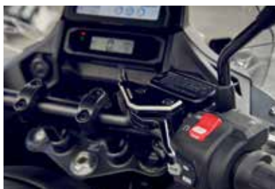
PARKING LEVER 08F70-MKT-D00

Only applicable to manual transmission versions of the NT1100, the quick shifter enables smooth but instantaneous clutchless gear shifts, both up and down. For an increased comfort and added sportiness of the riding experience.