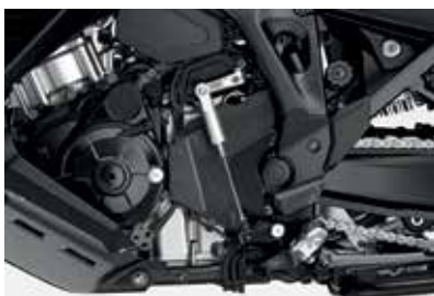
QUICK SHIFTER 08U70-MLF-E00

Only applicable to manual transmission versions of the NT1100, the quick shifter enables smooth but instantaneous clutchless gear shifts, both up and down. For an increased comfort and added sportiness of the riding experience.