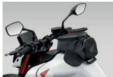
3L TANK BAG 08LB9-MKS-E00

A simple and functional rear bag specifically adapted to the tapered shape of the rear seat. Easy attachment and stable mounting is possible when installed with the rear seat bag attachment, which is not included. Bag capacity of 15L which can be expanded to 22L. Rear Seat Bag Attachment included 08L70-MKP-T00. Also, rain cover included.