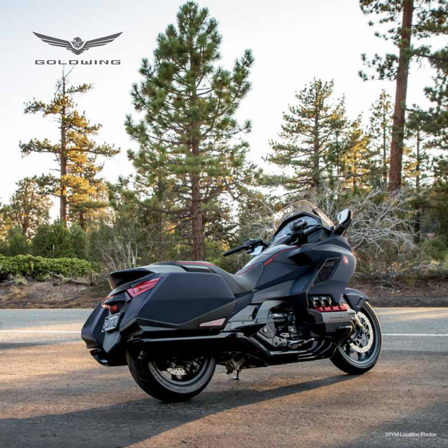
22YM Location Photos