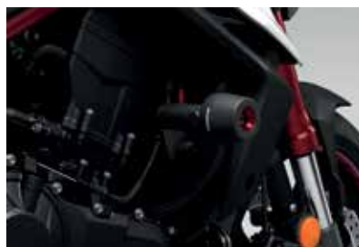
SKID PAD 08P70-MLB-D00

The skid pad, featuring the Honda logo, reduces damage of the fairing in case of a fall.