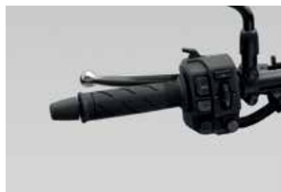
GRIP HEATER 08T70-MLB-D00

Extremely slim heated grips controlled by a simple operation of the integrated handle switch and displayed on the bike's TFT screen. Features 5 variable heating levels, integrated circuit to protect the battery from draining and memory function. Hand grip cement sold separately.