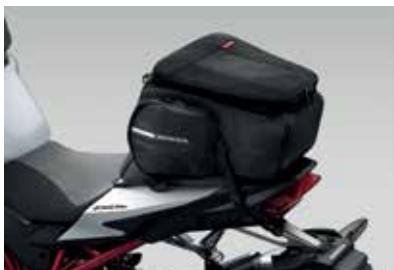
REAR SEAT BAG 08ESY-MLB-RRSEAT

Set of semi-rigid side bags (resin-made) Honda branded and specifically designed to suit the bike's shape, with waterproof inner bags and padlocks included. The bags have a 16.5L carrying capacity each and feature quick-release fasteners for easy attachment and detachment. Material / finishing: Textured Resin & Polyester, finished in Black. Maximum load capacity per panniers: 1.4 kg. Side Bags attachment included 08L74-MLB-D00.