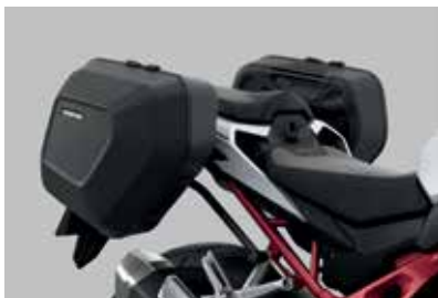
SIDE BAG 08ESY-MLB-SDB

Set of semi-rigid side bags (resin-made) Honda branded and specifically designed to suit the bike's shape, with waterproof inner bags and padlocks included. The bags have a 16.5L carrying capacity each and feature quick-release fasteners for easy attachment and detachment. Material / finishing: Textured Resin & Polyester, finished in Black. Maximum load capacity per panniers: 1.4 kg. Side Bags attachment included 08L74-MLB-D00.