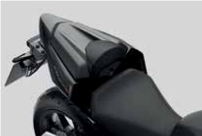
SEAT COWL 08F76-MJW-J00ZF

Custom shaped, colour-matching rear Seat Cowl that replaces the standard passenger seat for a sportier look.