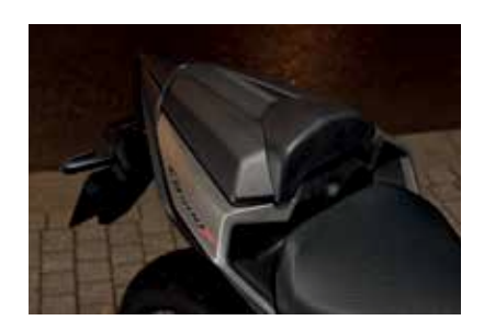
SEAT COWL 08F76-MJW-J00ZF

Custom-shaped, colour-matched Seat Cowl that replaces the standard passenger seat for a more sporty look.