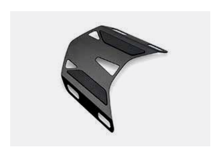
REAR CARRIER KIT 08L70-MKC-C40

The Rear Carrier Kit can be installed on the Gold Wing without a trunk. With its black finish with rubber inserts, it adds style and functionality.