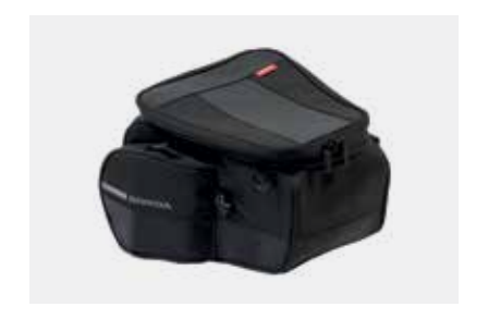
REAR SEAT BAG 08ESY-MKP-RRSEAT

Dimensions in mm (W x L x H): 178 x 285 x 130