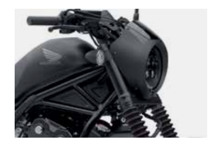
FRONT FORK COVERS SET

The fork boots have been tested to protect the tubes against scratches and to ease smooth fork motion. Mounted with the fork covers (sold separately), they accentuate the 500 Rebel's unique attitude.