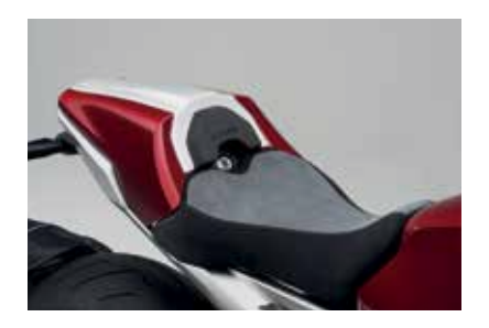
RIDER SEAT (ALCANTARA) 08F76-MKJ-E50

Thin and fully integrated with the other command, this set of heated grips are controlled through a 5-position switch on the left hand side.