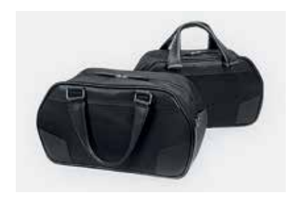
SADDLEBAG INNER BAG 08L01-MKC-A00

Helps to keep your trunk organized with convenient storage pockets for smaller items.