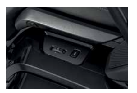
PASSENGER AUDIO SWITCH KIT 08A70-MKC-A00

Set of 4" speakers with amplifier specifically designed to provide clean and crisp music for the ultimate audio experience on the road.