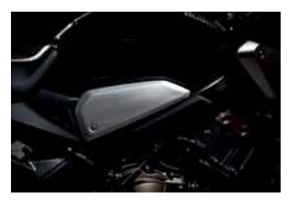
SIDE COVERS 08F75-MKN-D50

Pair of high-quality aluminium shroud covers beautifully engraved with the CB650R logo.