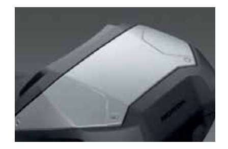
ALUMINIUM PANEL TOP BOX 08L83-MKT-D00

Give your panniers a premium touch with this set of aluminium design panels.