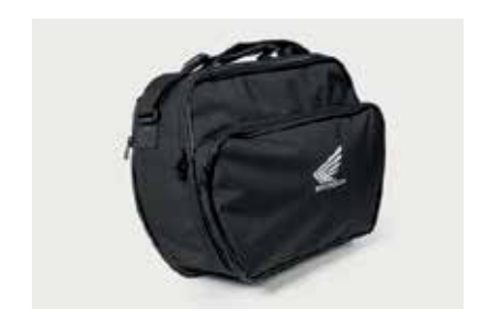
TOP BOX INNER BAG (35L) 08L09-MGS-D30

Functional rear seat bag with rain covers providing a capacity of 15L that can be expanded to 22L. Easy to attach and perfectly stable thanks to the specific attachment included.