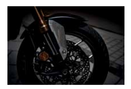
FRONT FENDER PANELS 08F73-MKN-D50

Pair of high-quality aluminium panels designed to fit the front fender and give your motorcycle the ultimate Neo Sport Cafe look.