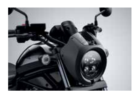
HEAD LIGHT COWL