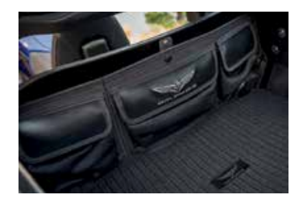
TRUNK LID ORGANIZER 08L78-MKC-A00

Helps to keep your trunk organized with convenient storage pockets for smaller items.