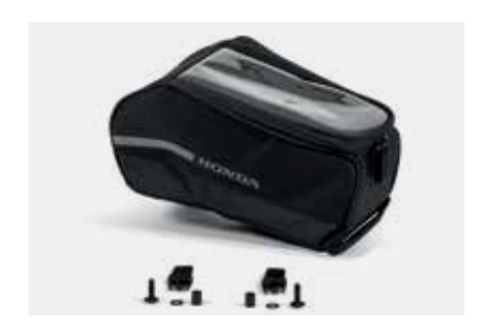
TANK BAG SET 08ESY-MKP-TKB19

A simple and functional tank bagadapted to the tank of the unit. Thanks to the specific attachment included, the stable mounting of the tank bag does not disturb the handling of this machine. Clear pocket on the top of the bag makes it possible for easy smart phone storage. Bag capacity is 3L and a rain cover is included.