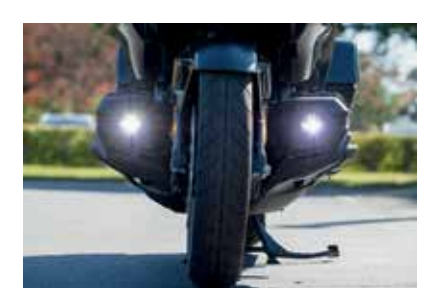
FRONT LED FOG LIGHTS 08ESY-MKC-FLK18

This pair of adjustable, bright white LED Fog Lights increase your visibility and make yourself more noticeable for the surrounding traffic. Delivers 880 Lumens and features a hard-coated lens. Waterproof connectors included.