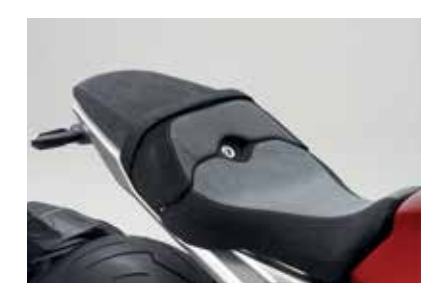
PILLION SEAT (ALCANTARA) 08F77-MKJ-E50

Made of luxurious Alcantara material, this rider seat brings the ultimate level of comfort and seating stability.