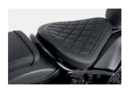
BLACK CUSTOM RIDER SEAT