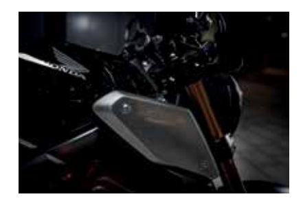
SHROUD COVERS 08F74-MKN-D50

Pair of high-quality aluminium panels designed to fit the front fender and give your motorcycle the ultimate Neo Sport Cafe look.