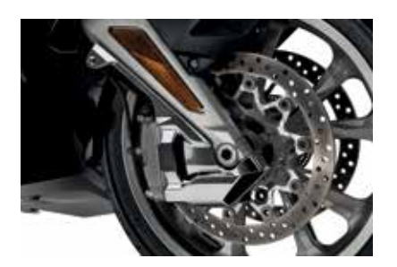
FRONT CALIPER COVERS 08F73 or 08F74-MKC-A00

Add some styling and additional cooling airflow to your front callipers with these covers.