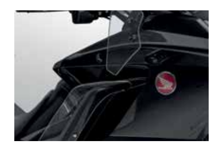
UPPER AIR DEFLECTORS

Respectively 225mm and 100mm longer than the Gold Wing and Gold Wing Tour windscreens, this accessory provides added protection from the elements.