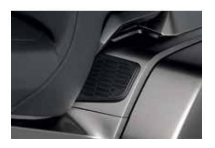
REAR SPEAKER KIT 08ESY-MKC-RR21

Pair of 25-watt speakers expanding the audio system of a no-trunk version. The Rear Speakers are installed in the saddlebags of the Gold Wing. Hardware and wires included.