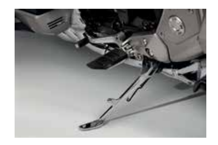
CHROME SIDE STAND 08M70-MKC-A00

A Chrome-plated Side Stand to add some style to your motorcycle.