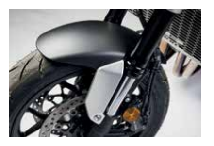
FRONT FENDER PANEL KIT* 08F79-MKJ-D00

Give your CB1000R a more sporty look with this set of Grip Ends and protect your grip in case of fall.