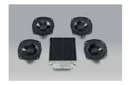
POWER AMPLIFIER KIT 08ESY-MKC-AMP22

Pair of 25-watt speakers expanding the audio system of a no-trunk version. The Rear Speakers are installed in the saddlebags of the Gold Wing. Hardware and wires included.