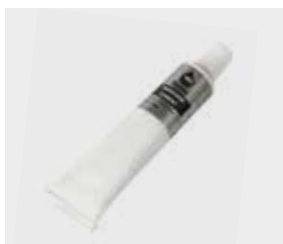
Hand Grip Cement 08CRD-HGC-20GHE

Heat resistant cement specifically designed for heated grips.