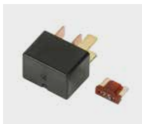
Relay kit 08A70-MGS-D30

To power up your electronic devices. Must be combined with sub harness (08A70MJLD30) and/or relay set (08A70MGSD30) sold separately. Ask your local Honda dealer for advice regarding these technical components.