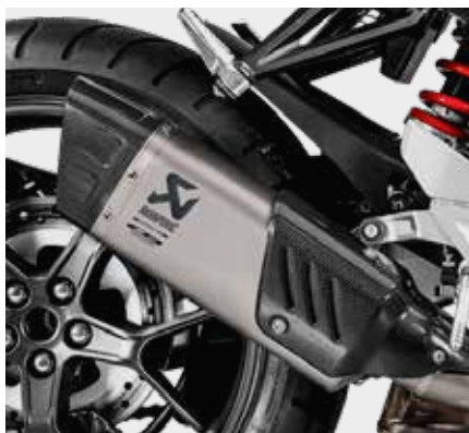
Titanium Slip-On muffler 08F88-MKJ-900

This beautifully crafted muffler is constructed from race-proven materials using lightweight titanium and finished with a hand-made carbon-fibre end cap and heatshield. Providing that unique Akrapović sound this exhaust reduces weight by over 54% from the stock system, leading to improved handling and manoeuvrability. It has a simple plug-and-play installation, and is fully EC- and ECE-compliant.