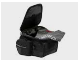
Rear Seat Bag Set 08ESY-MKJ-STB18

A simple and functional rear bag specifically adapted to the tapered shape of the rear seat. Easy attachment and stable mounting thanks to the specific attachment included.