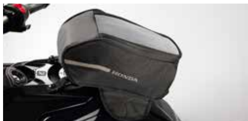
Tank bag set 08ESY-MKJ-TKB18

A simple and functional tank bag adapted to the tank of the unit. Thanks to the specific attachment included, the stable mounting of the tank bag does not disturb the handling of this machine. A clear pocket on the top of the bag makes it possible for easy smart phone storage.