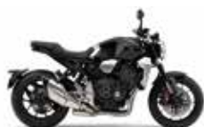
Graphite Black (Also available in CB1000R+ version)