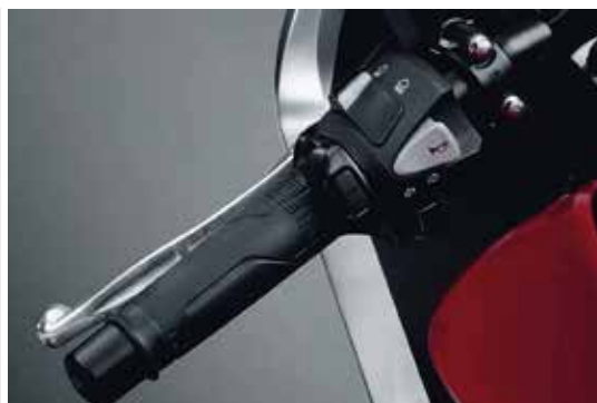
Easy Heated Grips Pack 08ESY-MJS-HG17M or 17DCT

Stylish PC fly screen*Provides relief from blasts on the chest at high speeds*50mm higher and 40mm wider than the factory std screen