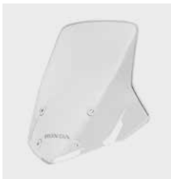
High screen 08R72-MGS-D10

Stylish PC fly screen*Provides relief from blasts on the chest at high speeds*50mm higher and 40mm wider than the factory std screen