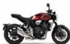
Candy Chromosphere Red