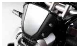
Meter Visor* 08R72-MKJ-D00

High quality aluminium panel that will underline the shape of hugger for a total Neo Retro look.