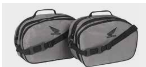
Inner Bags for 29L Pannier set 08L79-MGS-J30

Black nylon inner bag with stylish print, red colour zips and the Honda logo on its front. Front pocket that can contain A4 size file. Comes with adjustable shoulder belt and carrying handle. Black nylon inner bag with stylish print, red colour zips and the Honda logo on its front. Front pocket that can contain A4 size file. Comes with adjustable shoulder belt and carrying handle. 2 sizes available:- for 39L Top Box (08L39)- for 48L Top Box (08L48)