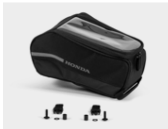
Tank bag set 08ESY-MKP-TKB19

A simple and functional tank bag adapted to the tank of the unit. Thanks to the specific attachment included, the stable mounting of the tank bag does not disturb the handling of this machine. Clear pocket on the top of the bag makes it possible for easy smart phone storage. Bag capacity is 3L and a rain cover is included. Dimensions in mm (W x L x H): 178 x 285 x 130