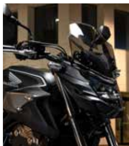
Wind screen kit (Smoke) 8R70-MKP-D40

The smoked wind screen improves the overall comfort of the bike by protecting the rider against the elements. It also adds to the appearance of the bike.