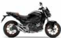
Graphite Black / Pearl Brown