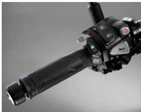
Easy grip heat pack 08ESY-MKN-HG19

Extremely slim heated grips which provide 360° heat around the grips. Features integrated control for maximum rider comfort and design integration. Features 3-step variable heating levels, integrated circuit to protect the battery from draining and smart heat allocation that focuses on the area of the hands most sensitive to cold. Attachment and Honda High-Temperature special cement included.