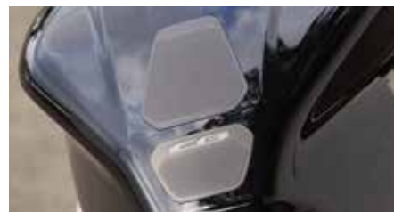
Tank pad kit (CB logo) 08P71-MKN-D50

Dimensions in mm (W x L x H): 355 x 365 x 243