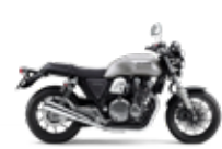
Mat Beta Silver Metallic