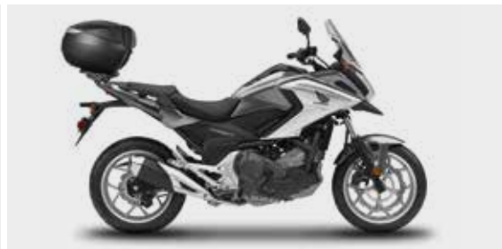
39L Top Box (*) 08L39-MKA-RTB, RTBA, C, E or G

39L Top Box with backrest, delivered with every components needed for mounting (plate, rear carrier) or to lock it with using the bike key.