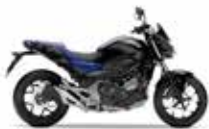
Graphite Black / Blue Metallic