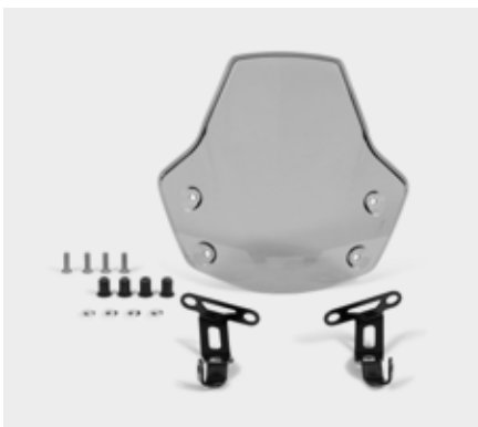
Front Visor (Smoke) 08R71-MKN-D50

Extremely slim heated grips which provide 360° heat around the grips. Features integrated control for maximum rider comfort and design integration. Features 3-step variable heating levels, integrated circuit to protect the battery from draining and smart heat allocation that focuses on the area of the hands most sensitive to cold. Attachment and Honda High-Temperature special cement included.