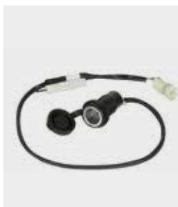
12V Accessory socket 08U70-MJW-J00

Extremely slim heated grips which provide 360° heat around the grips. Features integrated control for maximum rider comfort and design integration. Features 3-step variable heating levels, integrated circuit to protect the battery from draining and smart heat allocation that focuses on the area of the hands most sensitive to cold. Attachment included. Special heat-resistant glue available (sold separately).