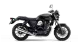
Darkness Black Metallic