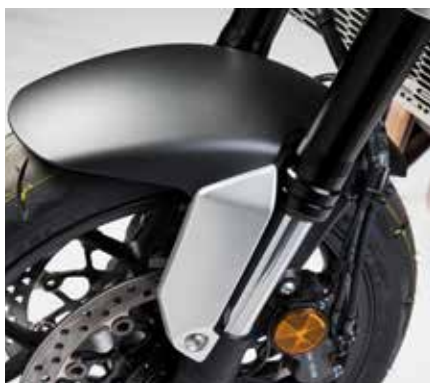
Front Fender Panel Kit* 08F79-MKJ-D00

High quality aluminium panel to add to the front fender of the CB1000R.