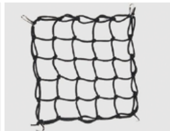
Cargo net 08L63-KAZ-011

Black nylon bag with silver Honda wing logo on front pocket. Expandable from 15 to 25L. Front pocket can contain an A4-size file. Comes with adjustable shoulder belt and carrying handle.