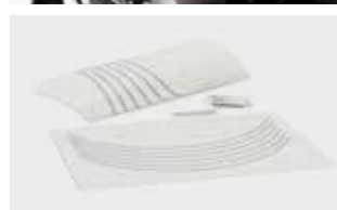
Wheel Stripe Kit 08F74-MKJ-D00ZA

Meter visor fitted with a high quality aluminium panel to enhance the iconic look of the CB1000R.