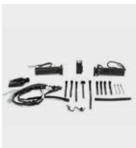
Heated grips set 08ESY-MJF-HG1617

The smoked wind screen improves the overall comfort of the bike by protecting the rider against the elements. It also adds to the appearance of the bike.