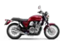
Candy Chromosphere Red