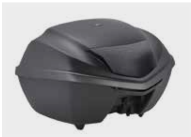
35L Top box 08L72-MJE-D00ZA

35L Top box designed for one key system Must be combined with: