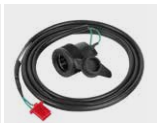
12V Accessory socket 08E70-MKA-D80

Heat resistant cement specifically designed for heated grips.