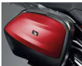
29L Panniers Set 08ESY-MKD-PA17

Pack including 2 specially designed, aerodynamic and fully integrated 29L panniers, with one key system, rear carrier, support and the requested components to install the one key system.