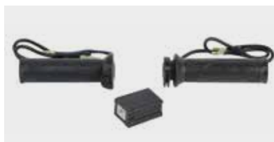
Heated Grips Pack 08ESY-MGC-HG17

Pair of extremely slim heated grips with integrated control for maximum rider comfort and design integration. 3 steps of variable heating levels with a smart heat allocation focussing on the hands areas the most sensitive to cold. Integrated circuit to protect the battery from draining. Attachment included (08I70-MGC-DA0) Special heat-resistant glue available* (*) Sold separately