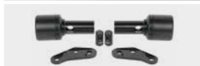
Engine guard with sliders 08P71-MGC-J80

Protects the surface of the engine cover Available in 2 colours: • Chrome plating (J80) • Mat Ballistic Black Metallic (J00)