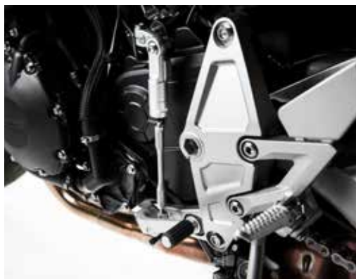
Quick Shifter* 08U70-MKJ-D00

Special warranty conditions applied. Ask your Honda Dealer.