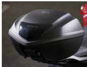
35L Top box Set 08ESY-MKP-TB19

A simple and functional tank bag adapted to the tank of the unit. Thanks to the specific attachment included, the stable mounting of the tank bag does not disturb the handling of this machine. Clear pocket on the top of the bag makes it possible for easy smart phone storage. Bag capacity is 3L and a rain cover is included. Dimensions in mm (W x L x H): 178 x 285 x 130