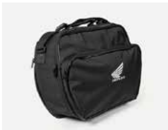
Top box inner bag (35L) 08L09-MG5-D30

Set including a 35L Top Box and all the components needed to install it on the bike (rear carrier and base). The key system provided make it usable the key of the unit. Inner bag included (08L09-MG5-D30).