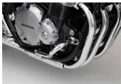
Tubular Engine guard 08P70-MGC-J80 or J00

Power or charge electrical equipment using this convenient 12V Socket (Provides 2A).