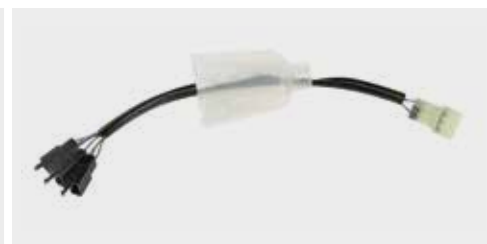
Sub harness 08A70-MJL-D30

This component is requested to power up Heated Grips and/or Navi attachment kit and/or Averta alarm.