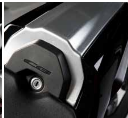
Single Seat Cowl* 08F80-MKJ-D00ZA, C or D

By measuring the intensity of the shifting input, the quick shifter enables the rider to change gear without the need to operate the clutch lever or shut the throttle. The system aids upshifting and downshifting, maximizing the riding experience.