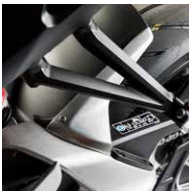
Rear Fender Panel* 08F78-MKJ-D00

High quality aluminium panel to add to the front fender of the CB1000R.