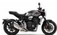
Sword Silver Metallic (Also available in CB1000R+ version)