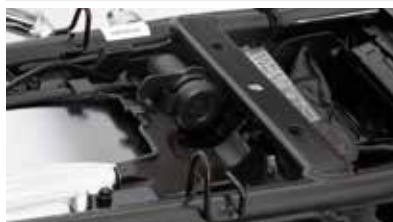
12V Socket Kit 08U70-MGC-J80

Pair of extremely slim heated grips with integrated control for maximum rider comfort and design integration. 3 steps of variable heating levels with a smart heat allocation focussing on the hands areas the most sensitive to cold. Integrated circuit to protect the battery from draining. Attachment included (08I70-MGC-DA0) Special heat-resistant glue available* (*) Sold separately