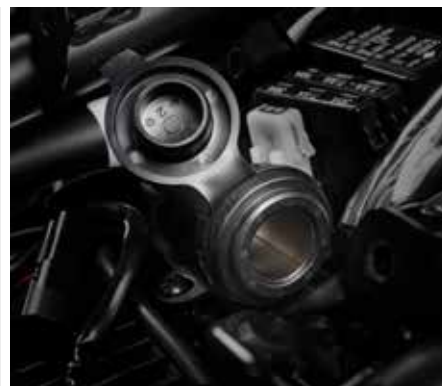
12V Accessory Socket 08U70-MKN-D50

Pair of left and right stays required to install either the front visor or the meter visor (sold separately).