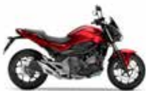
Candy Chromosphere Red