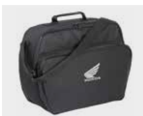
Inner Bag for 35L Top Box 08L09-MGS-D30

Pack including 2 specially designed, aerodynamic and fully integrated 29L panniers, with one key system, rear carrier, support and the requested components to install the one key system.