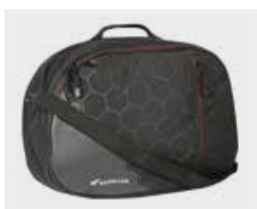
Inner Bag (*) 08L39-RTB-INNER / 08L48-RTB-INNER

Black nylon bag with silver Honda logo on front pocket. Expandable from 15 to 25L. Front pocket can contain an A4-size file. Comes with adjustable shoulder belt and carrying handle.