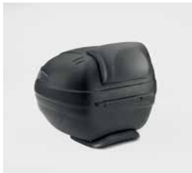
30L TOP BOX (ONE KEY) KIT 08L30-MKA-RTBWK

Pack including a 30-litre capacity Top Box with a backrest, and all the components needed to mount it on the bike. Comes with the one-key systems allowing to use the key of the bike to secure it.