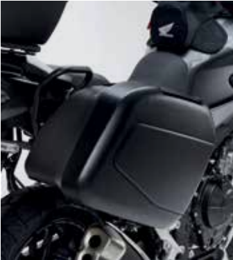
PLASTIC PANNIERS SET 08L70-MGZ-D80

Sturdy rear carrier with integrated pillion grab rails.