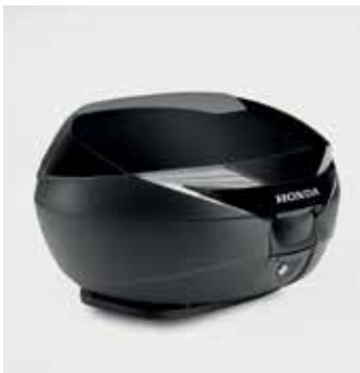
39L TOP BOX 08L39-MKA-RTBA, C, E OR G

Black nylon bag with silver Honda Wing Logo on front pocket. Expandable from 15 to 25L. Front pocket can contain an A4-size file. Comes with adjustable shoulder belt and carrying handle.