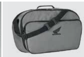
DELUXE INNER BAG - TOP BOX (45L) 08L81-MCW-H60

Additional upper backrest pad for superior pillion comfort.