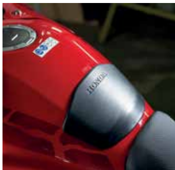
TANK PAD 08P70-MGH-J20

Improve the protection and gives a mounting for the fog lights (sold separately)