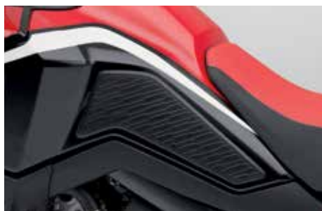
SIDE TANK PADS 08R81-MKS-E00

Made of stainless steel and featuring a "CRF" logo, these Radiators Grills give your Africa the ultimate Adventure touch. Their original mesh pattern combines ideal cooling capabilities and protection.