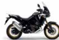
Digital Black Metallic