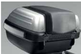
BACK REST FOR 45L TOP BOX 08P60-MBT-801

Additional upper backrest pad for superior pillion comfort.