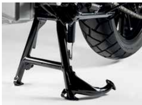
MAIN STAND KIT 08M70-MKP-J80

Facilitates cleaning and rear wheel maintenance, plus allows for more secure parking on uneven surfaces.