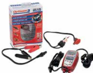
HONDA OPTIMATE 3 08M51-EWA-601E | 08M51-EWA-601U

Facilitates cleaning and rear wheel maintenance, plus allows for more secure parking on uneven surfaces.