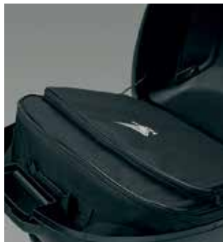
TOP BOX INNER BAG (35L) 08L09-MGS-D30

Pack including a 30-litre capacity Top Box with a backrest, and all the components needed to mount it on the bike. Comes with the one-key systems allowing to use the key of the bike to secure it.