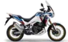
Pearl Glare White Tricolor