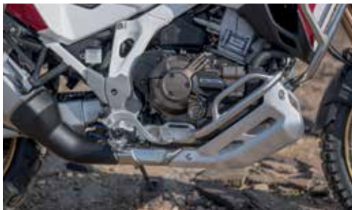
ENGINE GUARD WITH ATTACHMENT 08ESY-MKS-ENG

The Engine Guard improve the protection of the engine and the lower part of the bike. Made of stainless steel and finished with electrolytic polishing. This set includes: