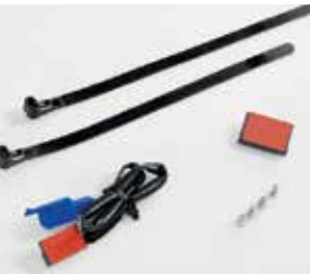
ALARM ATTACHMENT KIT 08E70-MKH-D20

A compact alarm unit with a 118db siren and a movement and shock detector, featuring 8 sensitivity settings. A back-up battery and a low consumption sleep mode ensure the battery is protected from draining. Must be combined with: - Alarm Connector (08E70-MKH-D20)* - Magnetic Switch (08E70-MCS-G40)* *Sold separately.