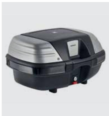
45L TOP BOX KIT 08ESY-MKA-TB45

Black nylon inner bag with stylish print, red coloured zips and Honda logo on the front. Includes front pocket that can hold an A4 size file. Features an adjustable shoulder strap and carrying handle.