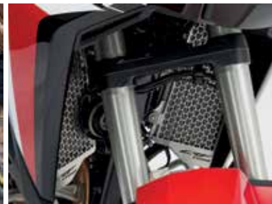
RADIATOR GRILLS 08F71-MKS-E00

Made of stainless steel and featuring a "CRF" logo, these Radiators Grills give your Africa the ultimate Adventure touch. Their original mesh pattern combines ideal cooling capabilities and protection.