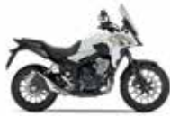
Pearl Metalloid White