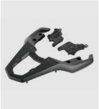
REAR CARRIER 08L71-MGZ-D80ZA

35-liters Top Box designed to be operated with your CB500X key. This set includes the rear carrier and the base needed to mount the top box on the bike. The key system is also included.