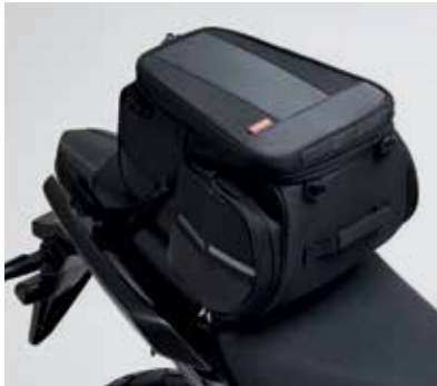
REAR SEAT BAG WITH ATTACHMENT 08ESY-MKP-SEAT

Small bag specially designed to fit the CB500X tank. The bag has 2 magnetic flaps and 2 removable straps. The kit includes 2 sets of screw pan, collar and plain washer and 2 adhesive protective films to protect the tank against scratches. Volume: 3 liters.