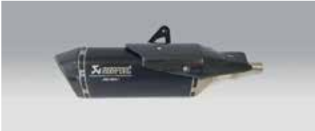
AKRAPOVIC EXHAUST 08F88-MKH-900

The main structure of this exhaust is in stainless steel. The silencer sleeve is in titanium, and both rear cap and protection are in carbon. Street legal