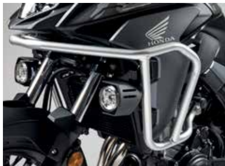
FRONT SIDE PIPE 08P72-MKP-J80ZA

Improve the protection and gives a mounting for the fog lights (sold separately)