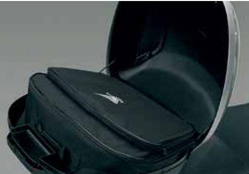
TOP BOX INNER BAG (35L) 08L09-MGS-D30

Robust mounting system for the Plastic Panniers Set.