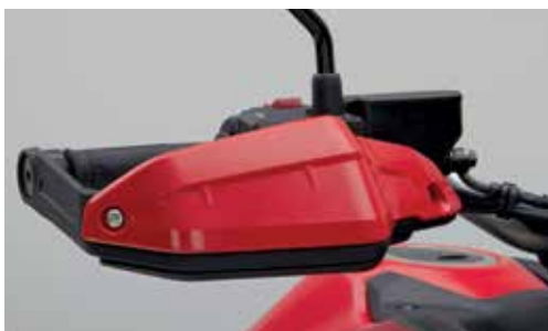
KNUCKLE GUARDS EXTENSION 08P72-MKS-E00ZD OR E00ZC

These reinforced side pads are specifically designed to fit the tank shape. They protect the paint against scratches and give a better control for the rider in a stand-up position.