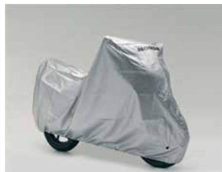
OUTDOOR CYCLE COVER XL 08P34-BC2-801

Suitable for all types of 12V lead-acid batteries of rated capacity from 3 to 50Ah. Effective on very neglected batteries from as low as 2 Volts. No risk of overcharging. Ensured safety for vehicle electronics. 2 versions available (EU or UK market).