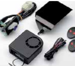
ALARM MAGNETIC SWITCH 08E70-MCS-G40

Connector needed to install the Averto alarm sold separately.