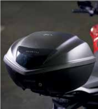
35L TOP BOX 08ESY-MJX-TBWK

35-liters Top Box designed to be operated with your CB500X key. This set includes the rear carrier and the base needed to mount the top box on the bike. The key system is also included.