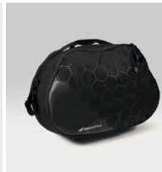
INNER BAG FOR 39L TOP BOX 08L39-RTB-INNER

Black nylon inner bag with stylish print, red coloured zips and Honda logo on the front. Includes front pocket that can hold an A4 size file. Features an adjustable shoulder strap and carrying handle.