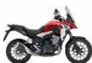
Grand Prix Red