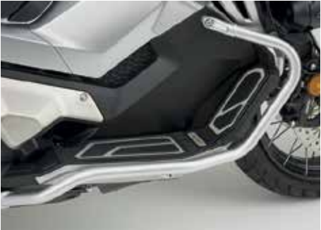
FLOOR PANEL KIT 08F70-MKH-D00

The main structure of this exhaust is in stainless steel, with the silencer sleeve in titanium and rear carbon cap. Street legal