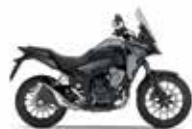
Mat Gunpowder Black Metallic