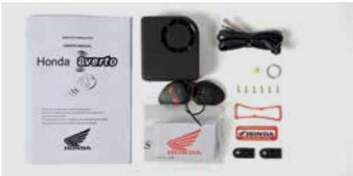
AVERTO ALARM SYSTEM 08E70-MGH-640

A compact alarm unit with a 118db siren and a movement and shock detector, featuring 8 sensitivity settings. A back-up battery and a low consumption sleep mode ensure the battery is protected from draining. Must be combined with: - Alarm Connector (08E70-MKH-D20)* - Magnetic Switch (08E70-MCS-G40)* *Sold separately.