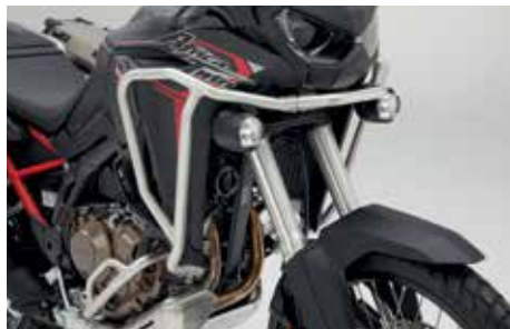
FRONT SIDE PIPE WITH ATTACHMENT 08ESY-MKS-L1FR

Providing a strong Adventure look, the Front Side Pipe improve the protection of the body. Made of stainless steel and finished with electrolytic polishing, it is resistant to corrosion and easy to clean. Can be used to fit the Front Fog Lights (sold separately). This set includes: