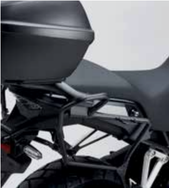
PANNIERS STAY 08L74-MKP-J80ZA

SA set of two aerodynamically shaped panniers especially designed to look fully integrated on the CB500X.