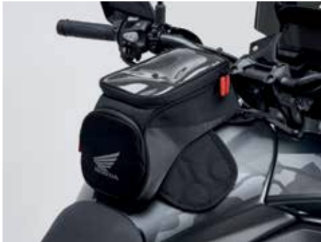
TANK BAG 08ESY-MKP-TKB19B

Black nylon bag with silver Honda wing logo on front pocket. Expandable from 15 to 25l. The front pocket can contain an A4-size file. Comes with adjustable shoulder belt and carrying handle.