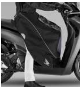
Scooter blanket 08T56-KTF-800/800A

Set of round-shaped 3-piece strips for easy Polycarbonate Windshield with knuckle visors included. Height: 46cm