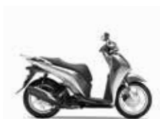
Lucent Silver Metallic