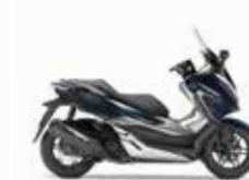
Crescent Blue Metallic