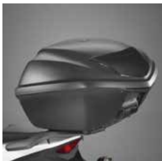
35L Top Box 08L71-KZL-8612A

35L of carrying capacity Top Box that can store 1 full-face helmet and more. Lid painted in mat cynos grey. Quicklocking and easily detachable. Key Cylinder Kit and base sold separately