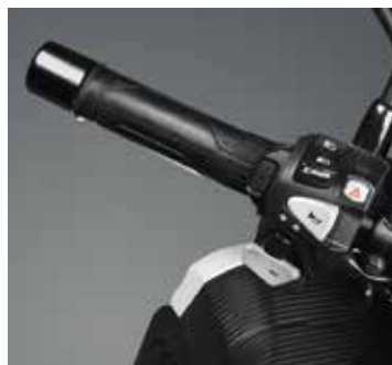
Heated Grips Kit 08ESY-MKH-HGA17

Silver Cowl Guard protects the motorcycle's fairing as well as providing a mount for the LED Fog Lights.