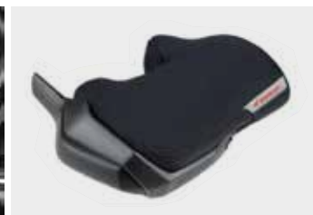
Hand grip covers* 08TUC-COV-GRIP

Thin and fully integrated with the other command, this set of heated grips are controlled through a 5-position switch on the left hand side.