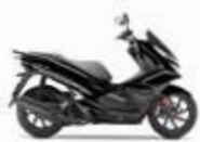
Pearl Nightstar Black