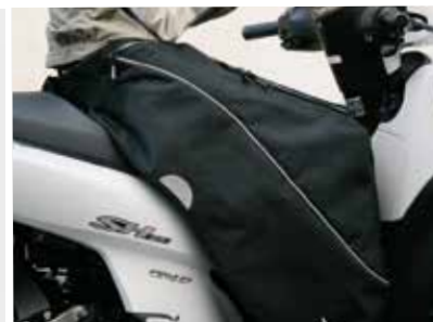
Scooter blanket 08T56-KTF-800 or 08T56-KTF-800A

Set of 2 injected polycarbonate knuckle visors that attach to the fairing and further improve wind protection.