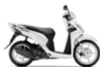
Pearl Cool White