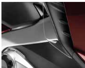
Leg deflector kit 08R70-MJL-D70

Connector needed to install the grip heaters