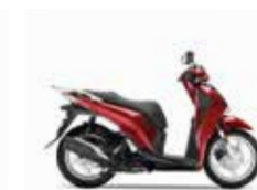
Pearl Splendor Red