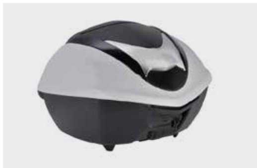
35L Smart Top Box Kit 08ESY-K53-TB192A, B, C, D, F or G

35L of carrying capacity. Can store 1 full-face helmet or 2 open-face helmets. Quick-locking and easily detachable. Top box pad and rear carrier included. Top box lid produced in matching colours for each models of SH300i available.