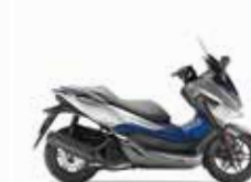
Mat Lucent Silver Metallic