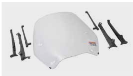
High Windscreen 08R70-K77-D20

Dimensions: 480 x 500 x 3mm. Constructed from polycarbonate. Knuckle visors not included)