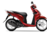
Pearl Splendor Red