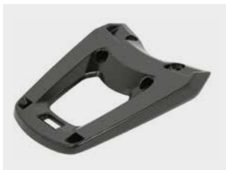
Top Box Base 08L71-K35-J01

35L of carrying capacity Top Box that can store 1 full-face helmet and more. Lid painted in mat cynos grey. Quick-locking and easily detachable. This kit includes the 35L Top Box, its base and a key cylinder.