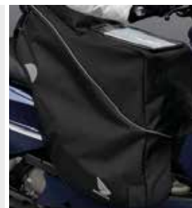
Scooter blanket 08T56-KRJ-800

The grip heater warms up the right and left grips of the handlebar for comfortable riding on a cold day. The grip heater switch is located on the right handlebar pipe. The attachment kit and the harness are included in the kit.