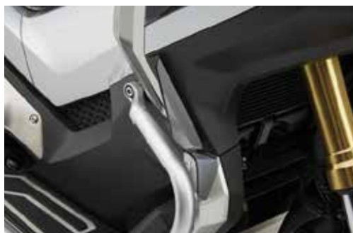
Foot Deflector Kit 08R72-MKH-D00

Channel the air flows around the X-Adv and improve the comfort of the riders during long journeys.