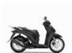
Pearl Nightstar Black