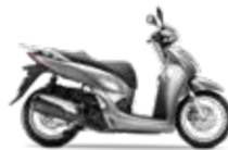
Lucent Silver Metallic