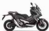
Mat Moonstone Silver Metallic