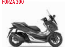
Mat Cynos Grey Metallic