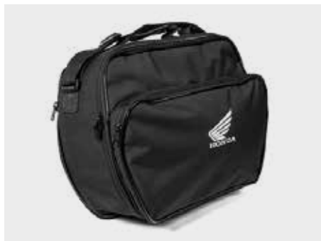
35L Top Box Inner Bag 08L09-M6S-D30

35L of carrying capacity. Can store 1 full-face helmet or 2 open-face helmets. Quick-locking and easily detachable. Top box pad included. Top box lid available in several colours to match all SH models available.