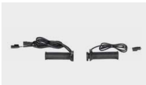
Grip Heaters 08T70-MJM-A01

Extremely slim heated grips with integrated control for maximum rider comfort and design integration. 5 steps of variable heating levels. Smart heat allocation that focus on the area of the hands the most sensitive to cold * Integrated circuit to protect the battery from draining. Special heatresistant glue available.