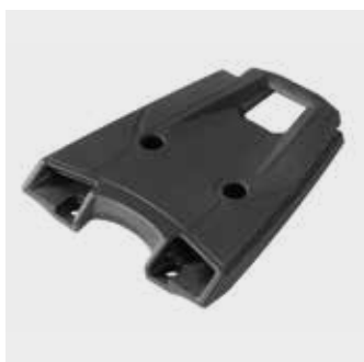
Top Box Base 08L71-MGZ-J01

35L of carrying capacity Top Box that can store 1 full-face helmet and more. Lid painted in mat cynos grey. Quicklocking and easily detachable. Key Cylinder Kit and base sold separately