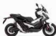
Mat Pearl Glare White