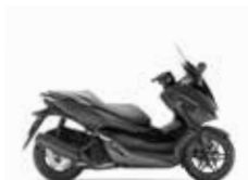
Mat Cynos Grey Metallic