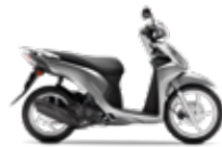
Moondust Silver Metallic