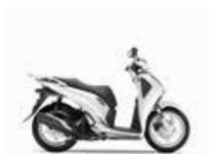
Pearl Cool White