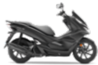
Mat Carbonium Gray Metallic