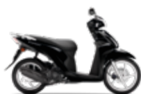
Pearl Nightstar Black