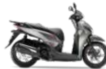
Matt Ruthenium Silver Metallic