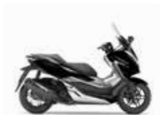
Pearl Nightstar Black