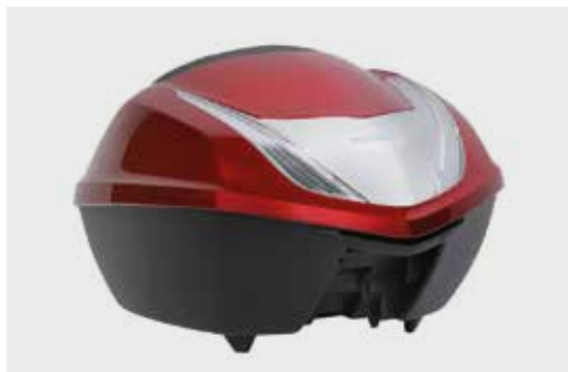
35L Top Box 08L70-K77-D01ZA, B, C or D

35L of carrying capacity. Can store 1 full-face helmet or 2 open-face helmets. Quick-locking and easily detachable. Top box pad included. Top box lid available in several colours to match all SH models available.