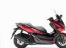
Mat Carnelian Red Metallic