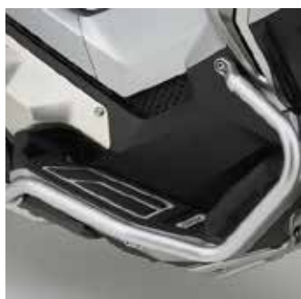
Front Side Pipe Kit 08P70-MKH-D00

Set of 2 additional LED headlights with all necessary components for fitment to the front side pipe. Increase the visibility for the riders and make him more noticeable for the traffic surrounding him. Front side pipe also included in this pack.