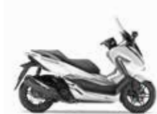
Mat Pearl Cool White