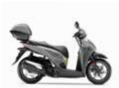
Air Force Gray / Titanium Green