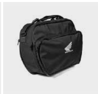
35L Top Box Inner Bag 08L09-MGS-D30

Complete kit allowing to operate the 35L Top Box with the scooter's key.