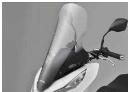
Wind Shield Kit 08R70-K96-T00

Specially engineered for PCX 125, this windshield features a sporty look that complements the scooter's styling. Dimensions: 566x466x4mm. All components required to install the windshield are included.