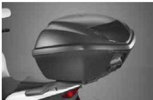
35L Top Box Kit 08ESY-K96-TB18

35L of carrying capacity Top Box that can store 1 full-face helmet and more. Lid painted in mat cynos grey. Quick-locking and easily detachable. This kit includes the 35L Top Box, its base and a key cylinder.