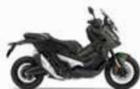
Mat Armored Green Metallic