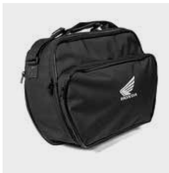
35L Top Box Inner Bag 08L09-M6S-D30

35L of carrying capacity. Can store 1 full-face helmet or 2 open-face helmets. Quick-locking and easily detachable. Top box pad and rear carrier included. Top box lid produced in matching colours for each models of SH300i available.