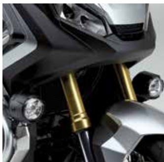
LED Fog Light Kit 08ESY-MKH-FLK17

Set of 2 additional LED headlights with all necessary components for fitment to the front side pipe. Increase the visibility for the riders and make him more noticeable for the traffic surrounding him. Front side pipe also included in this pack.