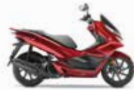
Pearl Splendor Red