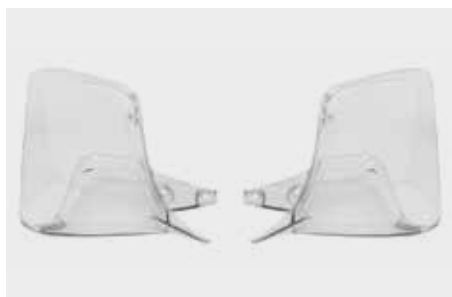
Knuckle Visor set 08P70-K77-D20

Dimensions: 480 x 500 x 3mm. Constructed from polycarbonate. Knuckle visors not included)