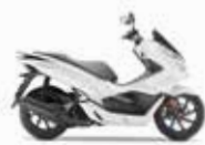
Pearl Cool White