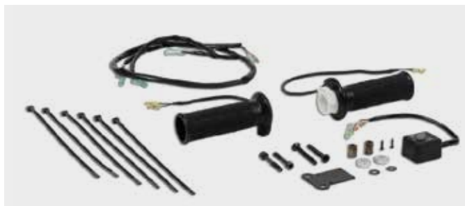
Grip Heaters Kit 08T70-K96-J00

Specially engineered for PCX 125, this windshield features a sporty look that complements the scooter's styling. Dimensions: 566x466x4mm. All components required to install the windshield are included.