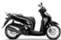
Pearl Nightstar Black