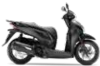
Mat Cynos Grey Metallic