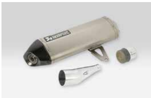
Akrapovic Slip-On Muffler (*) 08F88-MKA-900

Description: Titanium muffler with carbon fibre end cap. Non-removable noise reduction insert. Fitting kit included. Compliant with panniers and main stand. Performance: - Power: +0.6Kw at 4800 rpm | Torque: +1.2Nm at 2900 rpm | Weight: -1.0kg | EC/ECE approved