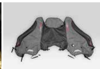
Leg cover* 08TUC-LEG-17

A set of two polyurethane Foot Deflectors that offer increased wind protection.