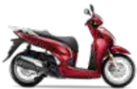
Pearl Splendor Red