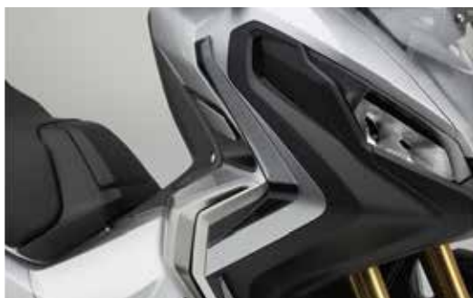
Deflector Pack 08ESY-MKH-DFL17

Channel the air flows around the X-Adv and improve the comfort of the riders during long journeys.