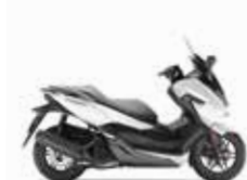
Mat Pearl Cool White