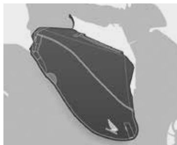
Scooter blanket 08T56-KTF-800

Set of Knuckle Visors that extend the protection provided by the Windshield.