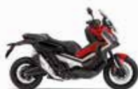
Grand Prix Red