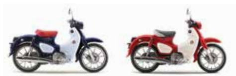
Pearl Niltava Blue