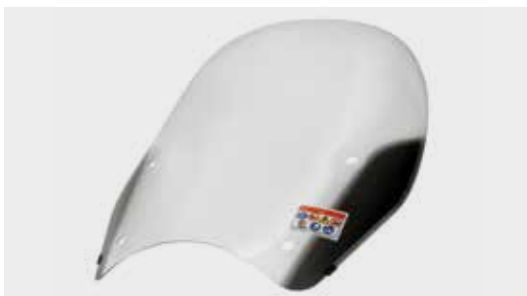
Wind Shield Kit 08R70-K44-D00

Windshield specially engineered for Vision. Improve the protection against the elements. Dimensions: 420x447x2mm. Knuckle visors set sold separately.