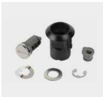
Key Cylinder Kit 08M71-KZL-840

Required to fix the top box to the unit.