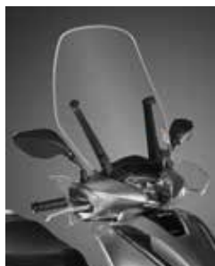
High Protection Windshield 08R70-K53-D00

Set of round-shaped 3-piece strips for easy Polycarbonate Windshield with knuckle visors included. Height: 46cm