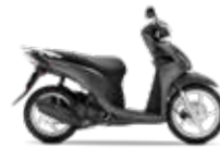
Mat Carbonium Grey Metallic