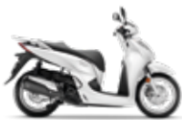
Pearl Cool white